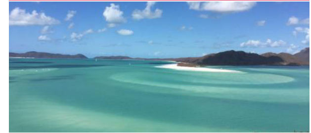
Lookout at Whitsunday Island, Australia

Walk the rainforest and snorkel the Great Barrier Reef! Australia's natural beauty is talked about worldwide. This ancient land is geologically one of the oldest on earth. The world's largest island and the only nation to occupy an entire continent, Australia is the size of the USA, yet has only 20 million people.