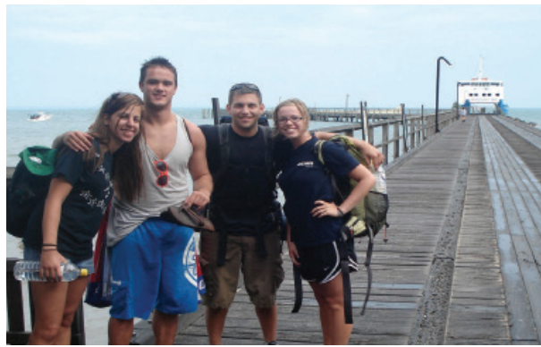
Hiking the world's largest sand island, Australia

Located in the state of Victoria on the southeastern tip of Australia, Deakin University offers three different campuses for study opportunities. Students may enroll in a wide variety of regular university courses in liberal arts, architecture, business, education, fisheries & wildlife, nutrition, exercise & sports science, mechanical engineering, construction engineering, and more. Deakin University is one of Australia's most progressive universities, and has twice won the prestigious University of the Year award.