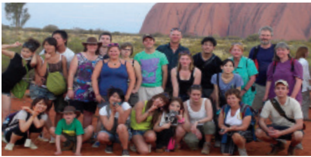
Ulura in the outback, Australia